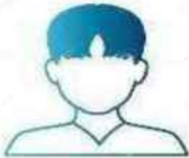
Photo (<50kb jpg. jpeg)